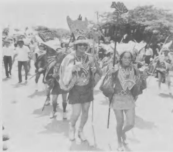
Life Under Water Group